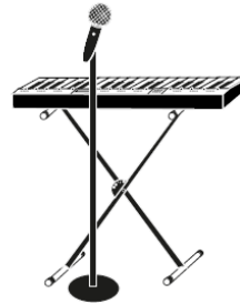
Front of Stage

We typically travel with our own FOH production person. We will supply all mics, stands and cables. We will provide L/R/Sub leads from our mixer to feed FOH.